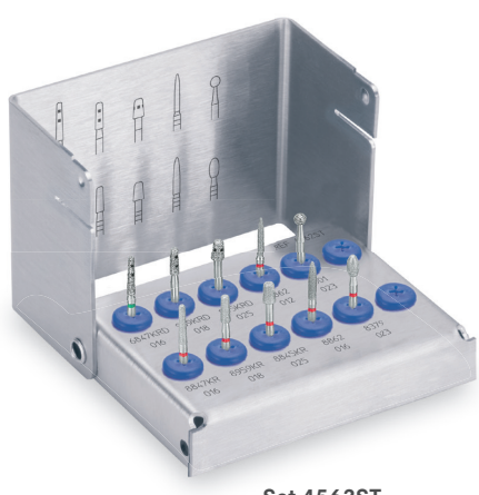
Set 4562ST In a bur metal block suitable for sterilization