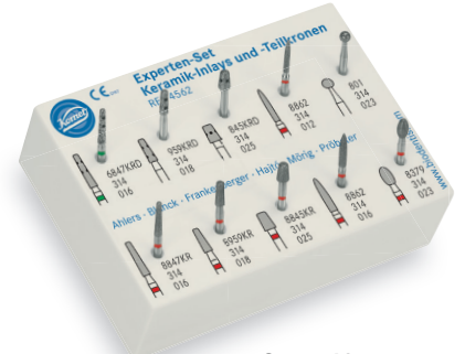
Set 4562 In a plastic instrument trav